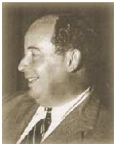
John von Neumann