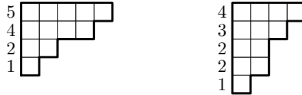
Figure 1: Young diagrams for a = (5, 4, 2, 1) and a^* = (4, 3, 2, 2, 1)

Let a = (a_1, \dots, a_s) and c = (c_1, \dots, c_t) be non-increasing non-negative integer sequences satisfying n = a_1 + \dots + a_s = c_1 + \dots + c_t . It is sometimes convenient to consider infinite sequences, and for this purpose we let a_i = 0 for i > s and c_j = 0 for j > t . Also we identify (a_1, \dots, a_s) and (a_1, \dots, a_s, 0, 0, \dots) . We say that a is dominated by c , written a \prec c , if \sum_{i=1}^k a_i \leq \sum_{i=1}^k c_i for all k \geq 1 . The sequence a determines a Young diagram. For example, the diagram for a = (5, 4, 2, 1) is shown on the left in Figure 1. (In the diagram we read the length of rows from top to bottom.)